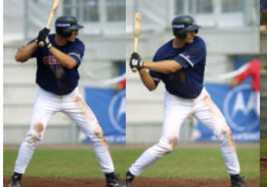
mostly on the back foot and the bat drawn back.

There are several stages involved in basic batting technique: