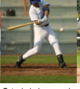
towards the pitcher with hops, then the shoulders, which pulls the bat through to meet the ball.